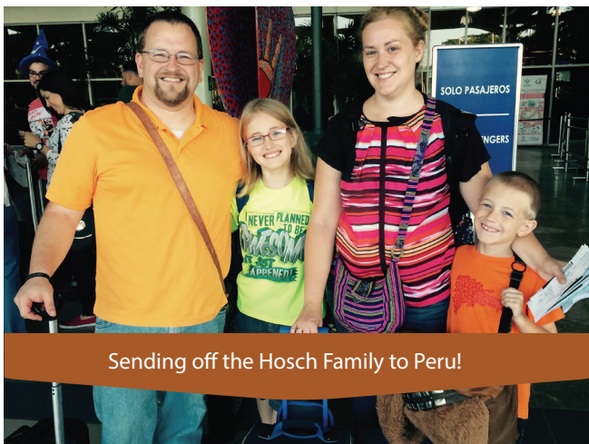
Sending off the Hosch Family to Peru!