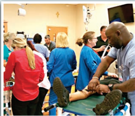
Team members worked to help the drill patients as they arrived at the Emergency Center.