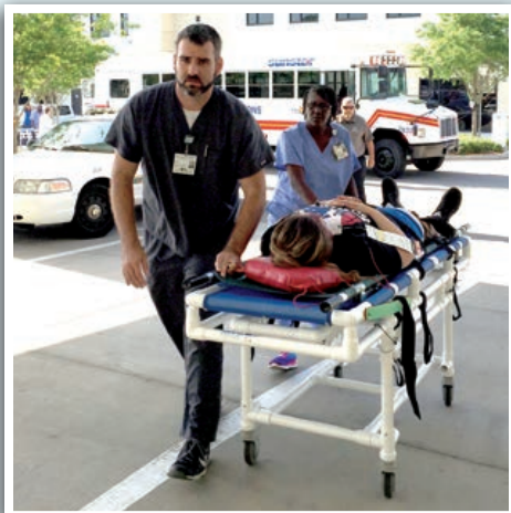
Patients were bused in from the drill "accident site" to St. Anthony's and then taken by team members to the Emergency Center on PVC stretchers.

Other BayCare hospitals that participated in the drill included Morton Plant; Mease Countryside; and Mease Dunedin.