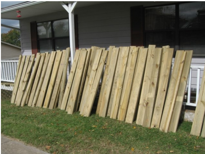
It took 102 of these boards to replace those we removed.