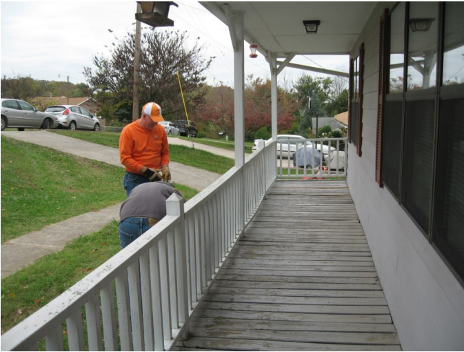
The project: Remove all these porch boards.