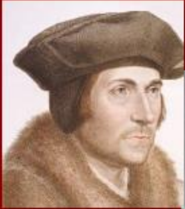
St. Thomas More

A unique opportunity to come together to be inspired by two saints who exemplified courage and conviction in the face of persecution and venerate their relics.