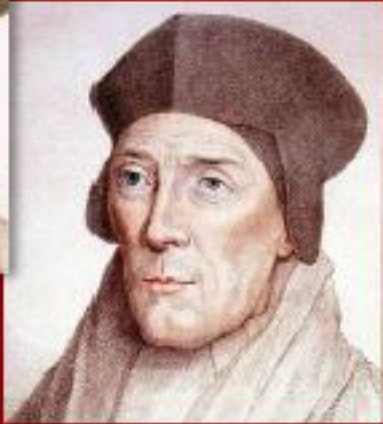
St. John Fisher

St. Thomas More and St. John Fisher were prominent 16th century Englishmen who stood against King Henry VIII's attempted supremacy over the Catholic Church, choosing Martyrdom over abandoning their faith.