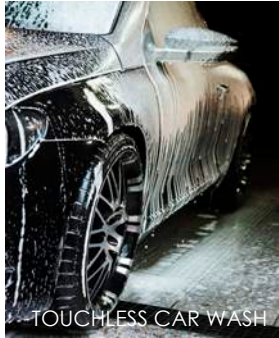
TOUCHLESS CAR WASH