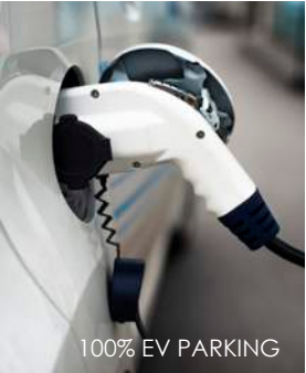
100% EV PARKING