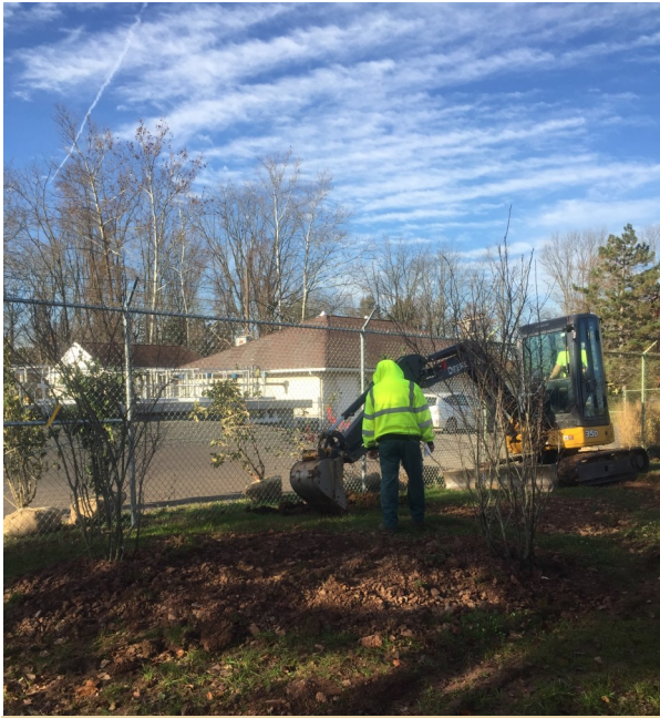
The Public Works Department beautifies the landscaping at the Valley Green Wastewater Treatment Plant on Defford Road.