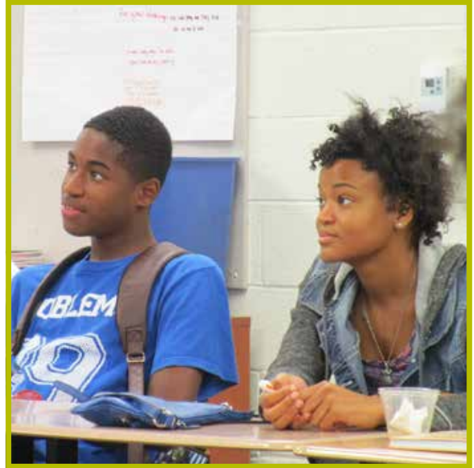
B.E.S.T. Students at the "Starting the College Conversation" Workshop