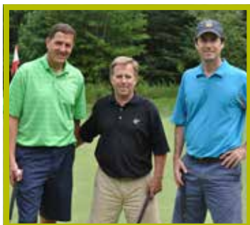
Golfers from Legg Mason