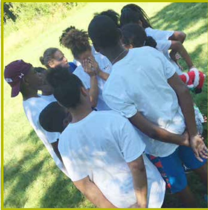
Outward Bound Team-Building Activity