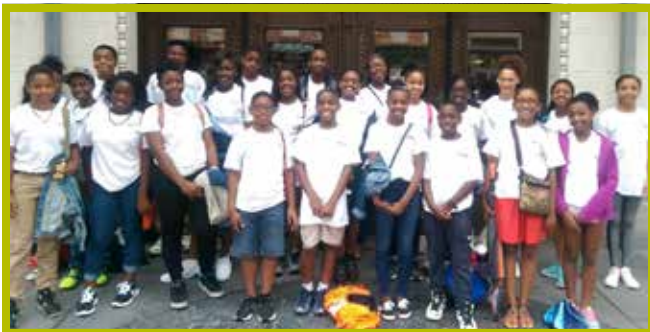
B.E.S.T. Summer Scholars in front of The Hippodrome Theatre during the field trip to Camp Hippodrome

In addition to academic courses, B.E.S.T. students participated in “Transitions” classes to address the social, cultural and academic changes they will face at their new school. Students also enjoyed two field trips, one to Camp Hippodrome and one to the Baltimore Chesapeake Bay Outward Bound School. These trips off campus allowed students the opportunity to learn about themselves, form closer friendships and embrace new experiences. Additionally, we hosted a special day of workshops for our rising 9 th graders and invited currently enrolled B.E.S.T. 9 th graders to join their Summer Scholars peers. The morning workshop “Transitioning from Middle School to Upper School,” featured a portion of the documentary Prep School Negro and a facilitated discussion about the African American independent school experience. The afternoon workshop, “Starting the College Conversation,” consisted of three activities which helped the students to