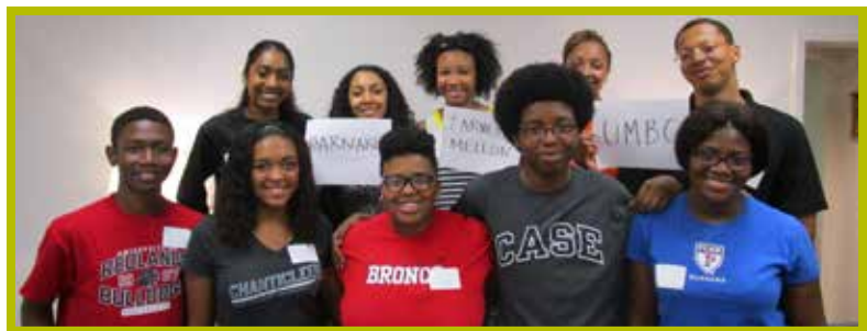
B.E.S.T. Alumni show off their college pride