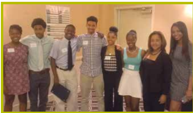
2014 B.E.S.T. student participants at Dale Carnegie's Young Adult Leadership Program Closing Exercises

Since 2013, Dale Carnegie Training Mid-Atlantic has partnered with B.E.S.T. to provide students the opportunity to participate in their nine week Young Adult Leadership Program. The program is designed to prepare young people for the real world by giving them the skills they need to reach their goals and live up to their full potential - at school, in their relationships, and in future careers. This summer, nine B.E.S.T. students participated in the course and two B.E.S.T. students who completed the program last summer returned as volunteer "Coaches." Through this partnership, our students gain confidence, enhance their communication, set and attain goals and refine their leadership skills.