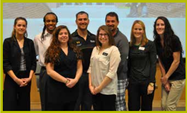
B.E.S.T. Staff with members of the Towson University Admission Office

The .edu Project of B.E.S.T. supports first generation college-bound students and their families with our annual student and parent workshops and our professional development within the broader Baltimore educational community. We partner with colleges and universities throughout Maryland in order to leverage the resources they can collectively provide to first generation students. In addition, B.E.S.T. founded the First Generation Affinity Group and chairs quarterly meetings comprised of college support professionals from independent, public and parochial schools, nonprofit leadership and admissions