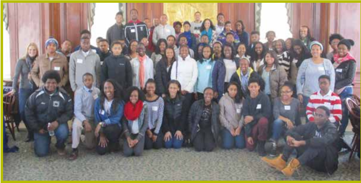
GBALI and B.E.S.T. Students with GBALI Directors and B.E.S.T. staff