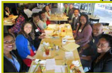
B.E.S.T. Alumni with Alumni Directors from B.E.S.T. Member Schools