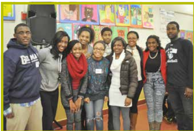
Members of the B.E.S.T. Class of 2015 at the Family Holiday Party