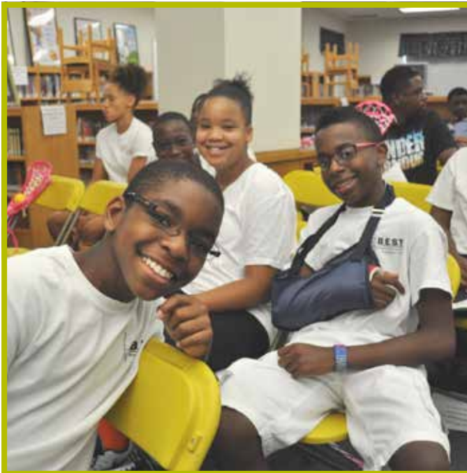
Happy B.E.S.T. Students at the Summer Scholars Closing Ceremony

B.E.S.T. would like to thank SunTrust Foundation and The Thomas Wilson Sanitarium for Children of Baltimore City for their generous funding.