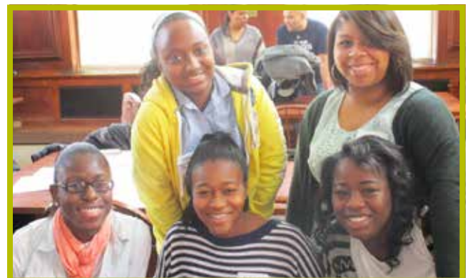
B.E.S.T. students at joint GBALI/B.E.S.T. event

In February 2015, B.E.S.T. partnered with GBALI to host a special session on "Careers and Entrepreneurship," inviting additional B.E.S.T. students to join GBALI for the day. Over sixty students joined together for an interactive morning that addressed using their gifts to pursue their passions.