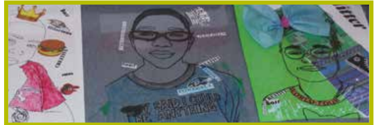
Self Portraits done by Summer Scholars

A new component of this year's program was an art project in which students spent time learning about Pop Artist Andy Warhol and then created a “pop art”-inspired self-portrait depicting their self-perception and feelings.