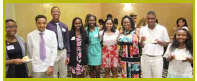
2015 B.E.S.T. student participants at the Dale Carnegie Young Adult Leadership Program Closing Exercises