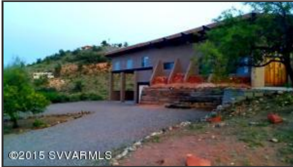
Passive Solar Home

3 Bedrooms office/Den, on 2.47 Hillside Acres.