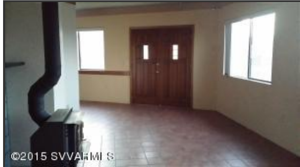
Entry & Living Room