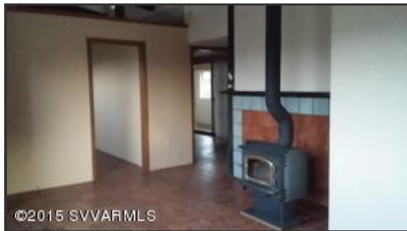
Keep Warm in the Winter