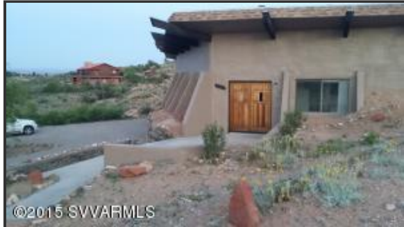
Low Maintenance Yard