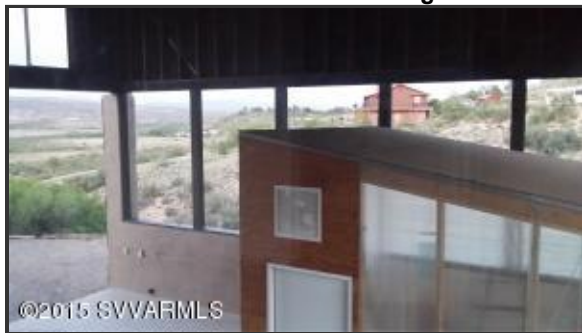
Green House & RV Garage