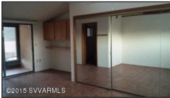
Mirrored Closet Doors