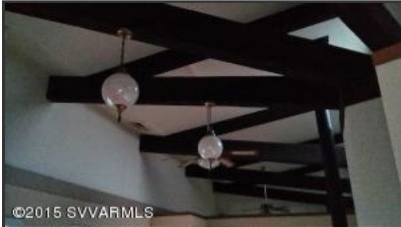
Living Room Beamed Ceiling