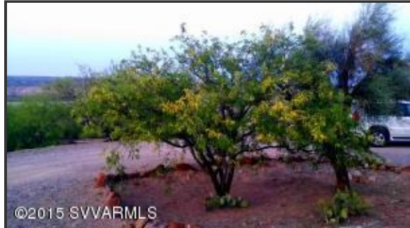
Native Shrubs and Trees