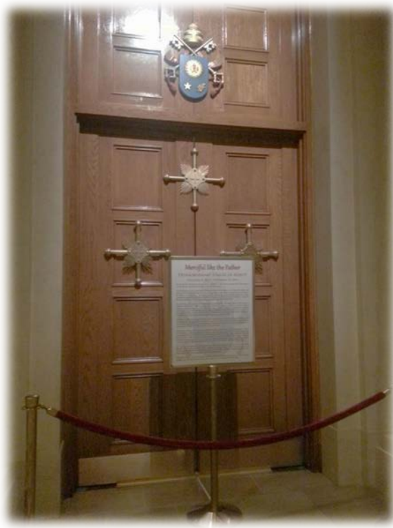
Holy Door -- National Basilica of the Immaculate Conception, Washington, DC

Each cathedral should designate a door as a Holy Door. It should be accessible to pilgrims, including those with disabilities. Preferably, use an interior door if the church has a vestibule. Most cathedrals have multiple doors for egress and exit. Choose a door that is one of several, that is, other doors may be used for crowds to go through, especially in case of emergency. Check with your local fire department for any local codes.