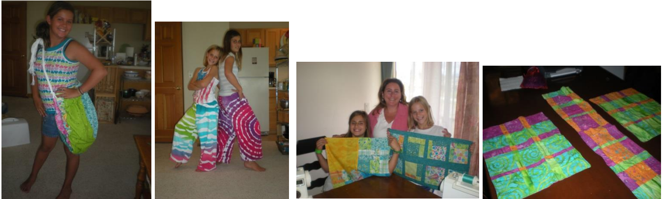
Girls Friendship Sewing Circle; Duffle Bags, Back Packs and Quilting