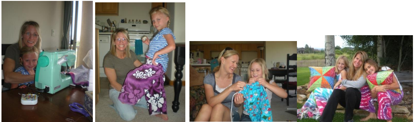
Parent ~ Child Relationship Enrichment Sewing Lessons; Sew projects with each other