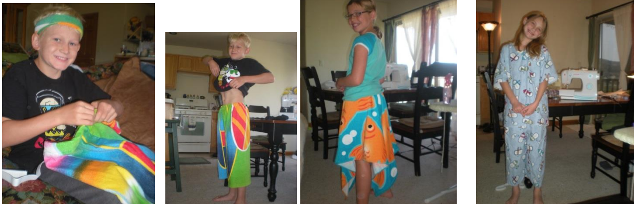
Beach Towel and Fleece Comfort Clothes and Flannel Jammies