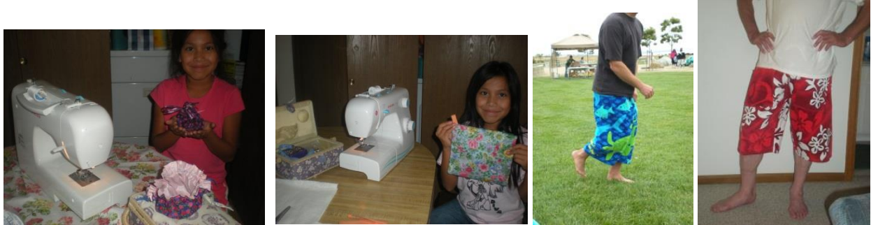
Mother's Day Jewelry Pouch and Potholders & Table Runners – Father's Day Beach Towel Comfort Pants