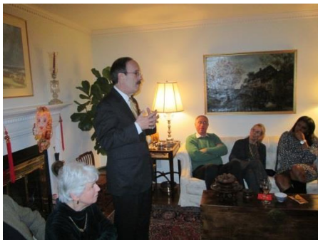
United States Congressman Elliot Engle speaks to the LWV Chinese New Year gathering.