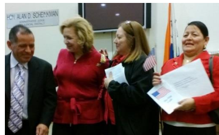
The League distributes pamphlets to all new citizens during Naturalization Ceremonies at the Westchester County Courthouse.