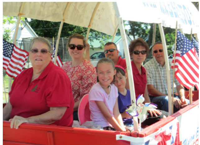
Union County Chamber of Commerce Ambassadors ride along during the Elgin Stampede parade.