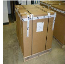
Box and Skid