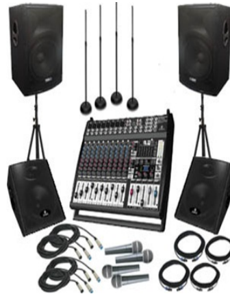
Public Announcement Systems