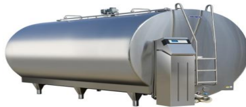
Milk Cooling Tanks