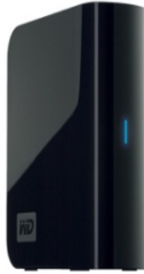
Digital Media Devices