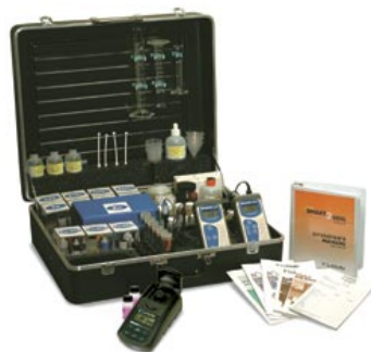
Soil Testing Equipment