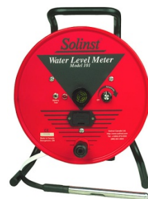
Water Level Meter