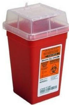
Syringes & Disposal Containers