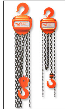
Replacement Hooks and Chains