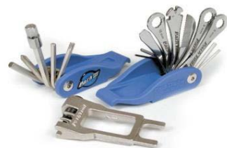
Bike Repair Tools