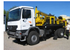
Mobile Drilling Fleet