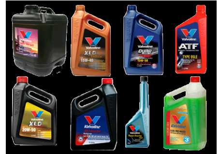
Motor Oil and Engine Additives