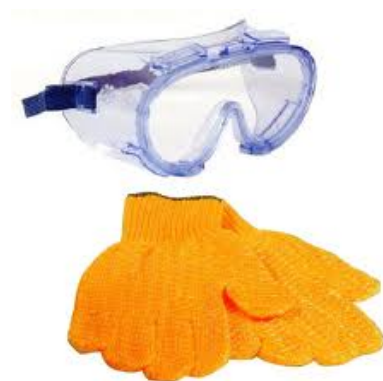
Personal Protection Equipment (PPE)