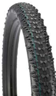
Spare Bike Parts