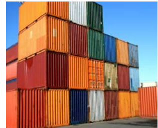
20' or 40' containers