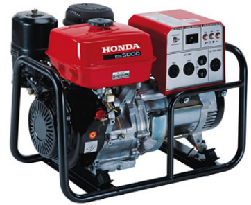
Small Standby Generators (Diesel/ Petrol)