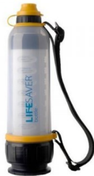
Portable Water Filters

British Berkefeld world class ceramic filters