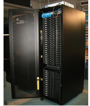
Servers & Rack