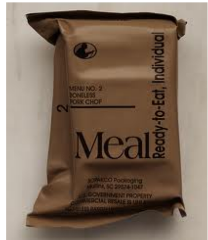
Meals Ready to Eat