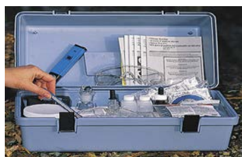
Water Testing Kits