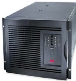
Large APC Units