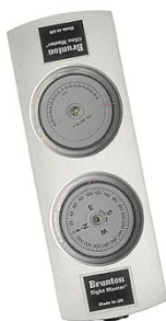
Compasses & Clinometers

Whether you need a sleeping bag and tent to protect you from the elements or a machete for clearing your path, we can recommend and supply the equipment to fit your needs and budget. Once on location, we can make sure you have the equipment you need to do your testing and sampling.