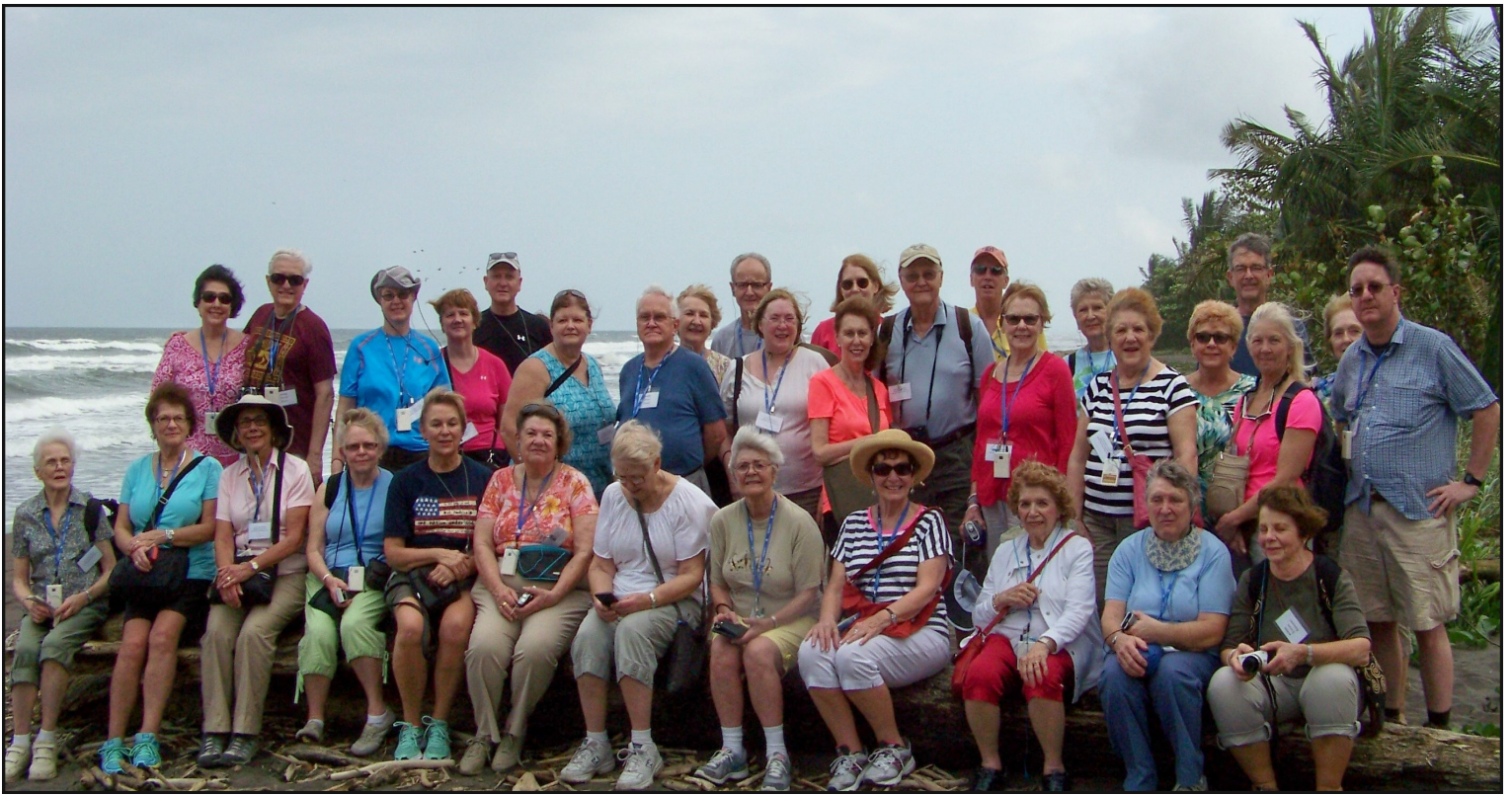
Thirty-eight OLLI members and friends escaped the cold this winter and traveled to Costa Rica in January/February. Trip highlights included a stay at an eco-lodge in Tortuguero National Park, many monkey and sloth sightings, zip lining, white water rafting, lounging in the hot springs, walking across many hanging bridges, a jungle crocodile safari, and lounging on a beautiful beach. This photograph was taken on the eastern shore near the town of Tortuguero.

Find us on Facebook Search for OLLI at SVSU