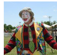
Smiley the Clown