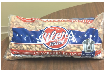
1 bag dried beans, 2 lbs.