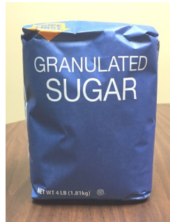
1 bag sugar, 4-5 lbs.