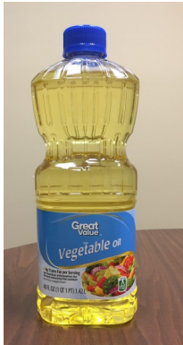
1 bottle cooking oil, 48 oz. or less

Kits should be delivered to the Morristown District office on Tuesday, May 23 between 8:30 and 5:00 or Wednesday, May 24 between 8:30 and noon.