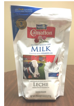
1 pkg. powdered milk, 10 oz. or less