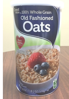
1 box oatmeal, 18 oz. or less