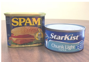
2 cans meat: ham, spam, or tuna