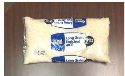
1 bag rice, 2 lbs.