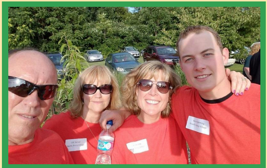
The winning putt-putt team selfie! North Perry Village brought home the coveted Putt Putt Tournament prize for 2016