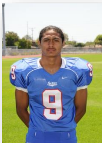
Class of 2013

*Currently a student at California State University, Northridge