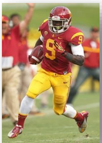
Class of 2010

*Currently a student and member of the track team at Duke University