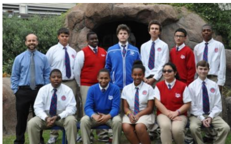
Serra Model United Nations c.2014