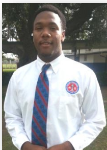
Class of 2015

"Here at Serra High I found a whole new family. Serra has taught me to care for others and not just myself. I am surrounded by many individuals that constantly challenge me to be a better person and student. Without the support of donors, students, and faculty none of this would have been possible. "