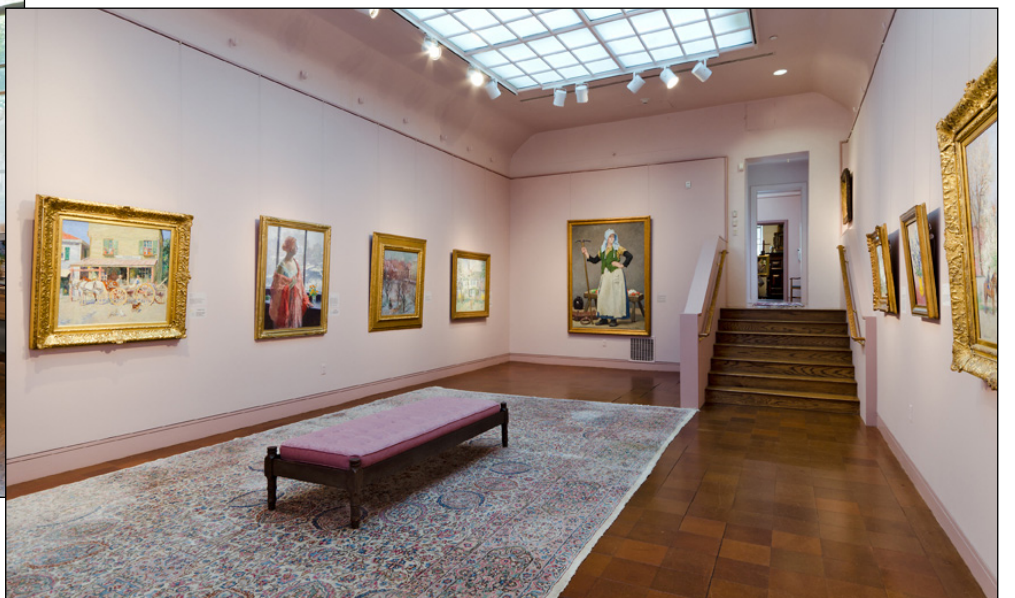
This gallery showcases some of Melchers' Southern paintings, notably "A Native of Virginia," circa 1925 — on the far wall — presenting a weathered farm woman standing alone with her hoe and vegetables beside her. It is a realistic picture that recalls the artist's equally unsentimental depictions of working residents in Holland. This painting is not in the show.