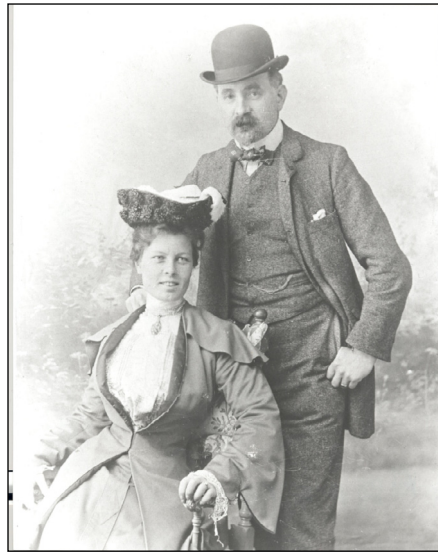
Here, Gari Melchers and his wife Corinne pose at Belmont, where they lived happily, enjoying the peace and quiet of their Virginia enclave. He is dapper in a three-piece suit, bow tie and derby. She sits elegantly, wearing a large hat, looking as lovely as she does in her husband's many paintings of her.