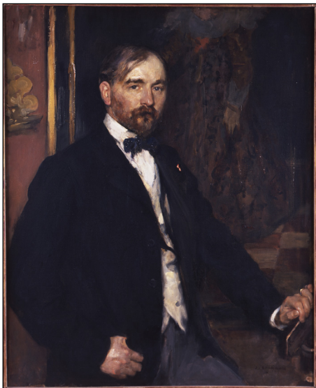
This portrait of Melchers is by James Jebusa Shannon, an American-born, leading British portraitist. He conveys his fellow artist's somewhat disheveled look, intense gaze and hints at Melchers' modesty, unaffected by his successes as a painter of international renown. This painting is not featured in the show.