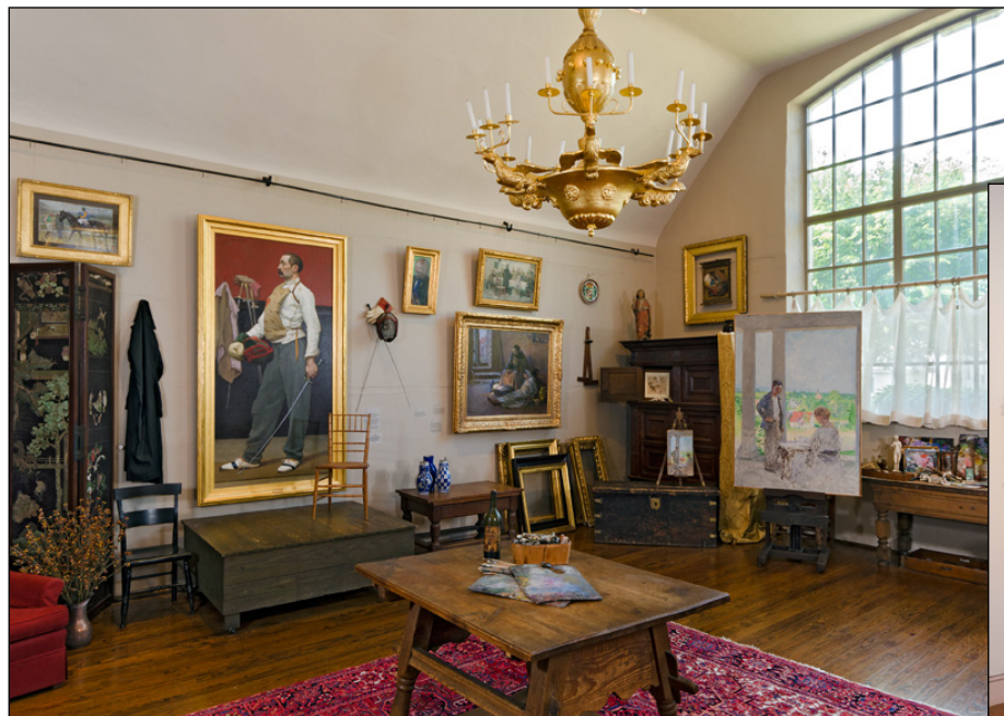
Among the highlight paintings in Belmont's elegant studio room is, on wall to left, "The Fencer," circa 1895, depicting a ramrod straight master of the sport in an academic style. This oil on canvas measures a sizable 80 7 / 8 by 39 1 / 4 inches and had a long exhibition record. The studio remains outfitted with Melchers' workbench, easels, brushes, palettes and other tools of his trade. A retrospective organized by Diane Lesko in 1990-91 for a tour beginning at the Museum of Fine Arts in St Petersburg, Fla., documented the high quality and international scope of the various styles in which Melchers worked. The painting is not in the show.