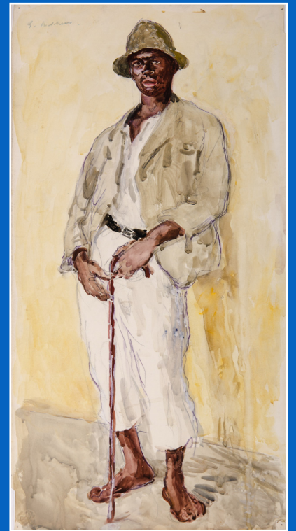
Melchers found many attributes in common among Dutch peasants and black workers in the Western Hemisphere, "A Harbor Boy," circa 1928, is set in Barbados. Both represented to him the virtues of traditional values and hard work.