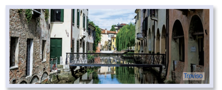
Day 9 Treviso to USA or extend your stay with an optional Milan extension Morning transfer to the airport for your return flight home. (B)

Day 8 Treviso – Padua and Vicenza Optional Tour In Italy's northern Veneto region, your guided tour of Padua this morning will take you to delve into this picturesque town through arch-covered streets that open to large piazzas filled with shops and restaurants. View numerous churches and chapels of this medieval city as well as the 800 years old University of Padua, the Italy's second-oldest university. Stroll across one of many bridges spanning the Bacchiglione River. In the town of Vicenza discover the acclaimed Palladian Villas designed by architect Andrea Palladio and protected by UNESCO as part of a World Heritage Site. Takein the Olympic Theater and stroll the famous Contra Porti Street lined with palaces. Enjoy dinner at your hotel. (B,D)