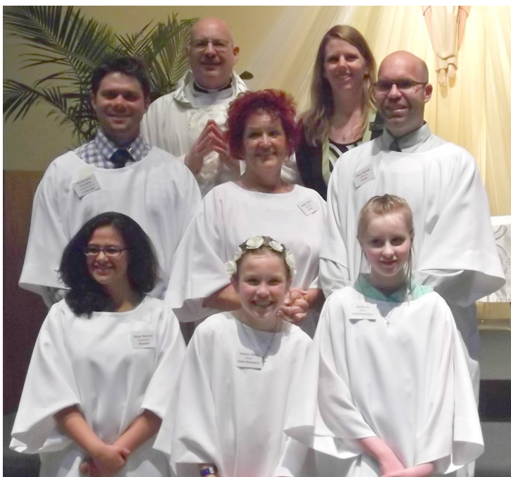
Congratulations to our newest Roman Catholics who were fully initiated into the Church at Easter!