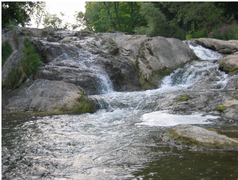
Coeymans Falls.