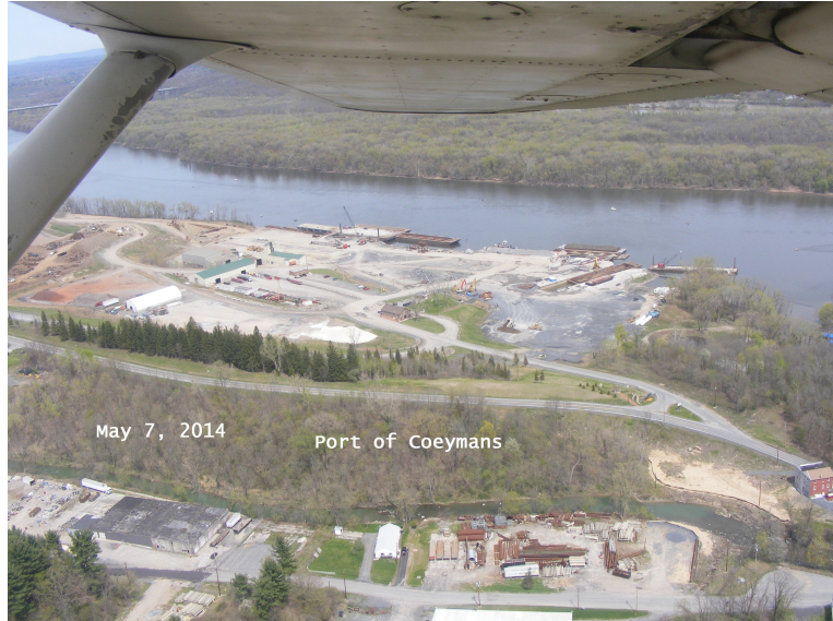
Aerial photo of the Port of Coeymans on the Hudson River, with Coeymans Creek in the foreground.

As a result, several groups have filed a lawsuit against the Town of Coeymans and Port of Coeymans, which has yet to be resolved.