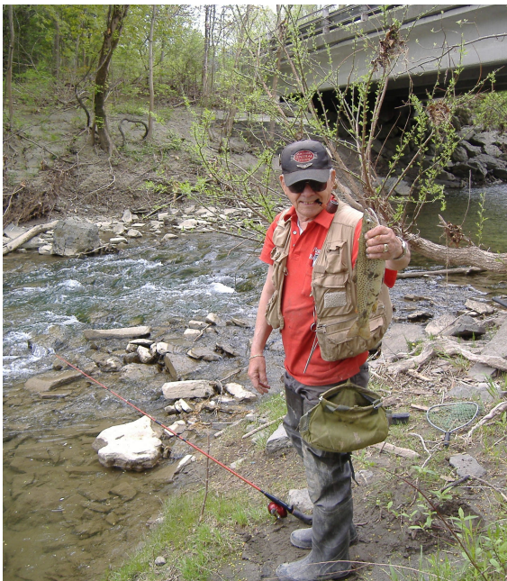
Angler on creek.