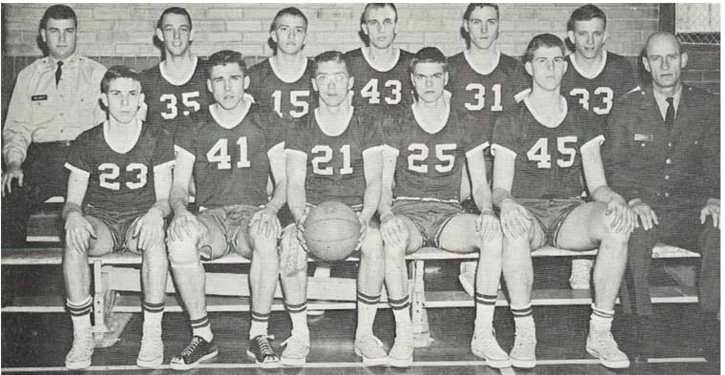
WMA1963-64 High School Basketball Team