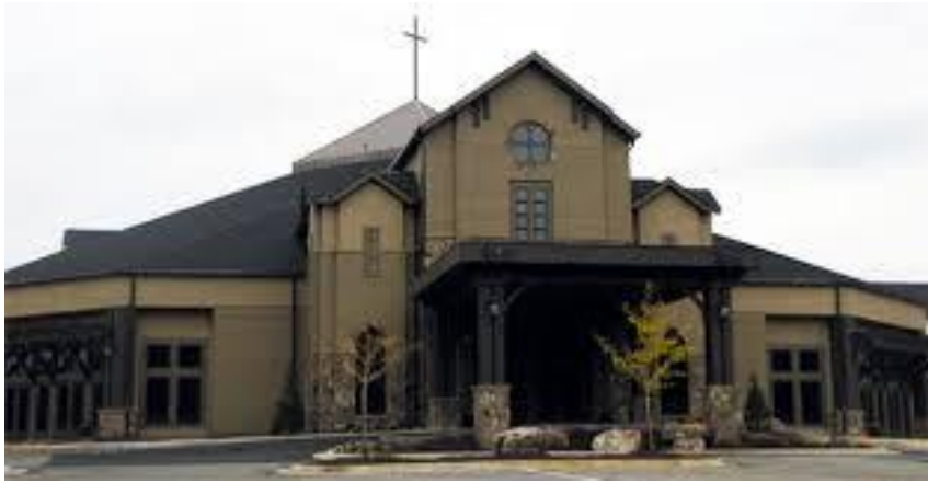
Piedmont Church 570 Piedmont Road Marietta, GA 30066