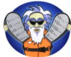
Illustration by: Rick Jimenez Powerboat Magazine