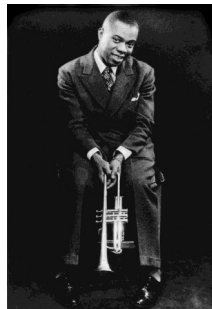
4x2 Louis Armstrong, ca. 1930s.