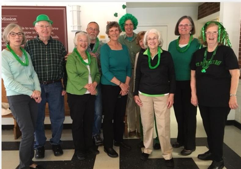
PrimeTimers enjoying St. Patrick's Day.