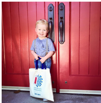
A couple of our new friends on the first day of school.