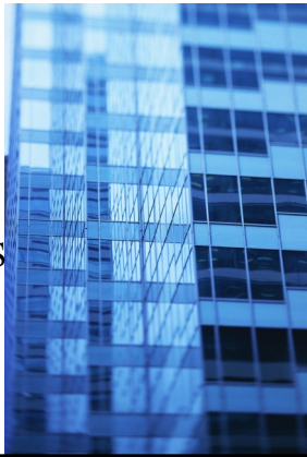
Above: The AU Campus area network buildings with Fiber Optic

The United Nations Office of project Services UNOPS was designated Execution Agency.