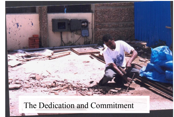
The Dedication and Commitment

Capacity Building comprises of the most challenging of projects. We have to build indigenous skills as we enhance institutional capacities.