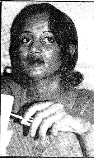
Turn to page 11

This investment (which is the first of its kind for the OAU) will enable the funded organization, OAU, to implement a campus-wide network interconnecting six