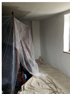
Interior painting of John Chads House