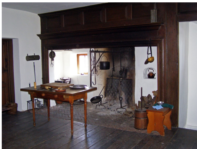
Interior painting of the Barns-Brinton House