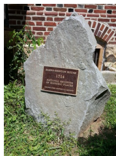
Historical marker at Barns-Brinton House

Additional enhancements included painting of meeting and exhibit rooms at the Visitors Center, a new HVAC system at the John Chads House, and a new well pump and dehumidifier at the Barns-Brinton House. The Visitors Center will be getting a new cedar shingle roof and gable repair later this April. Improvements were made possible with grants and volunteers.