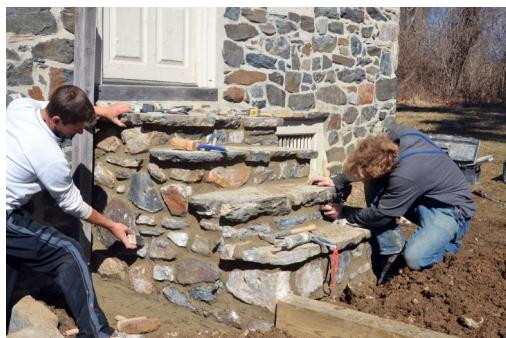
New steps at John Chads House

Part of the Society's commitment to preserving history is the maintenance of three historic buildings: the John Chads House (c. 1725), Springhouse and Barns-Brinton House (1714). As with any old structure, this requires significant expense and time. We are happy to report that many improvements have been made over the last year to ensure the buildings are here for future visitors to enjoy.