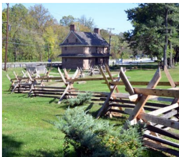
New fence at Barns-Brinton House - courtesy Eagle Scouts