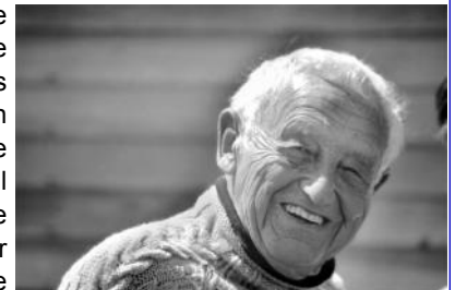
Andrew Wyeth