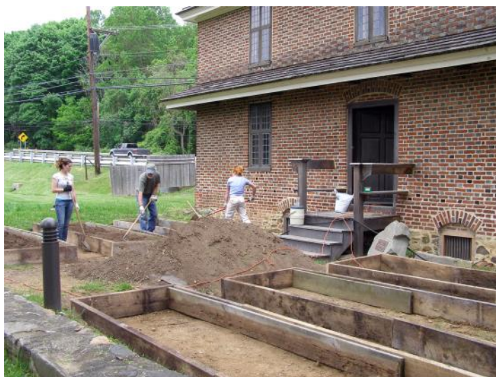
New garden boxes at the Barns-Brinton House