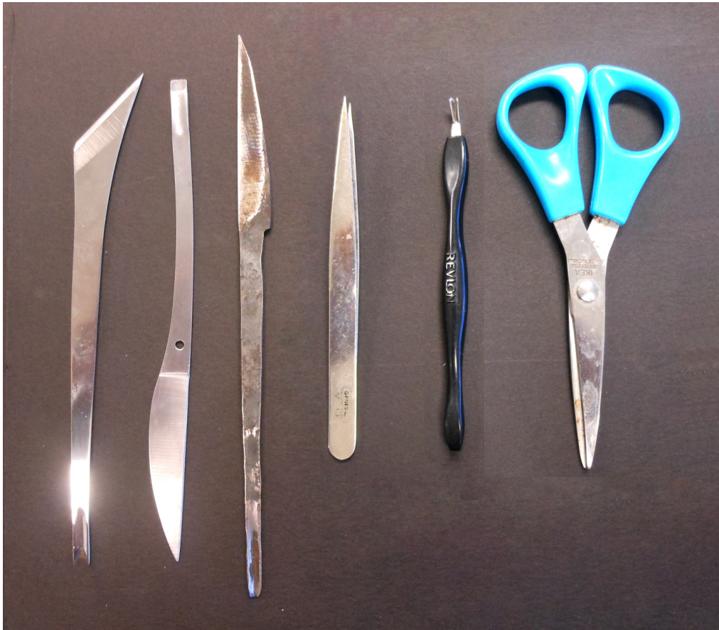
Carving Tools: Carving Knife, Tweezers, Cuticle Remover, Scissors