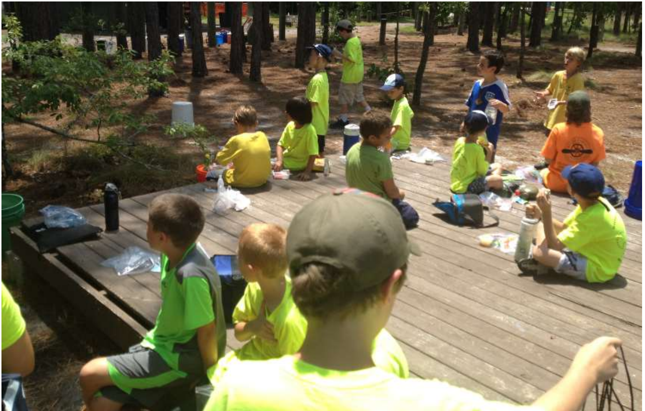
Scouts found some shade and a place to sit with friends and enjoy lunch together.