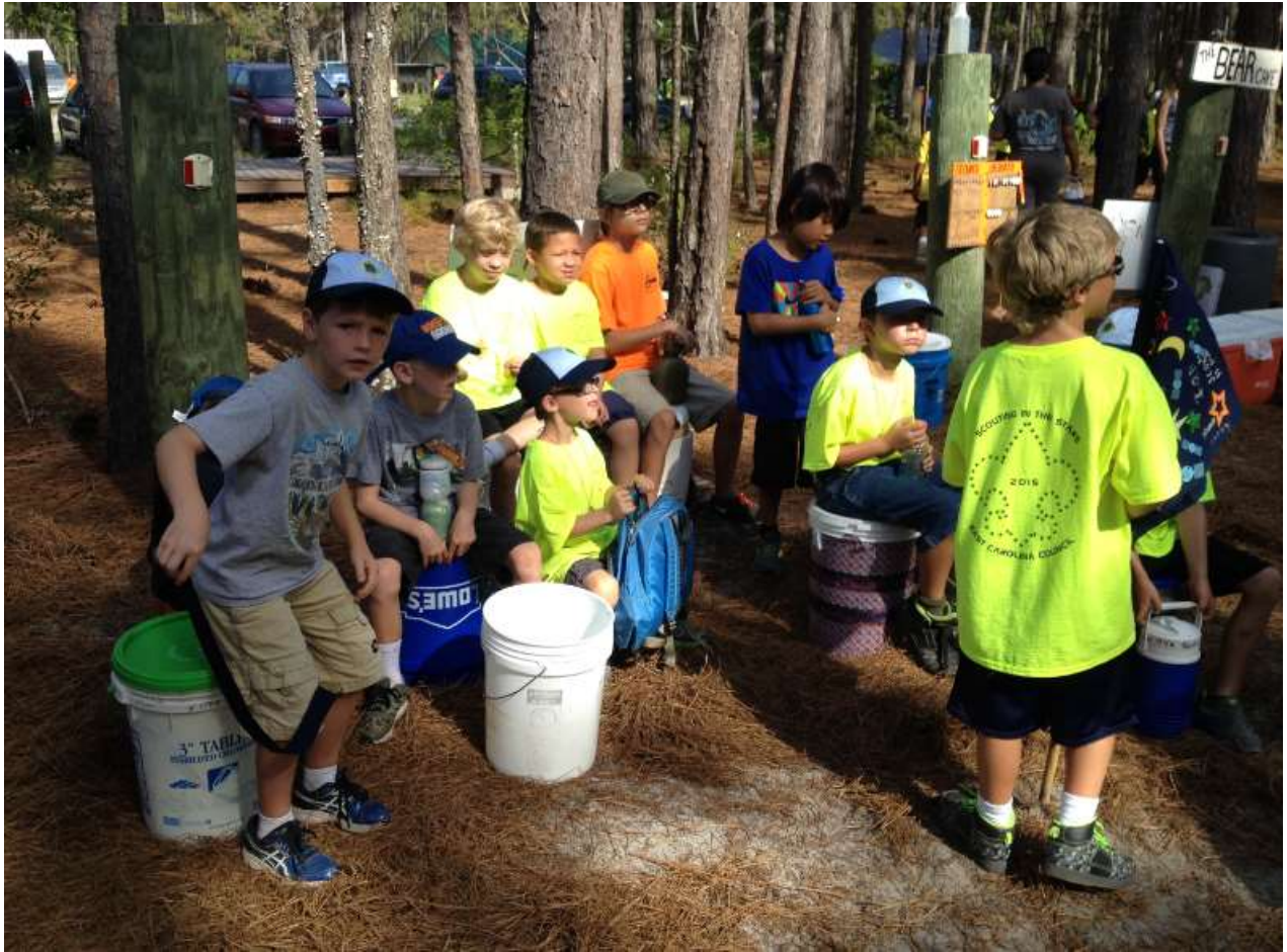
Scouts assembling at their post each morning to put their ziplocked lunches into iced coolers. Throughout the day, each station had a large yellow jug of ice water where Scouts were reminded to hydrate and refill their water bottles.