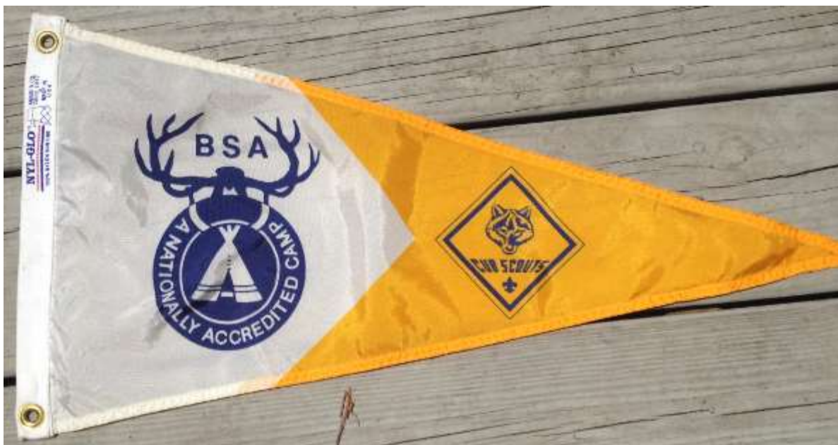
The 2015 Summer Day Camp Program at Camp Sam Hatcher once again received National Accreditation and this pennant to proudly display.