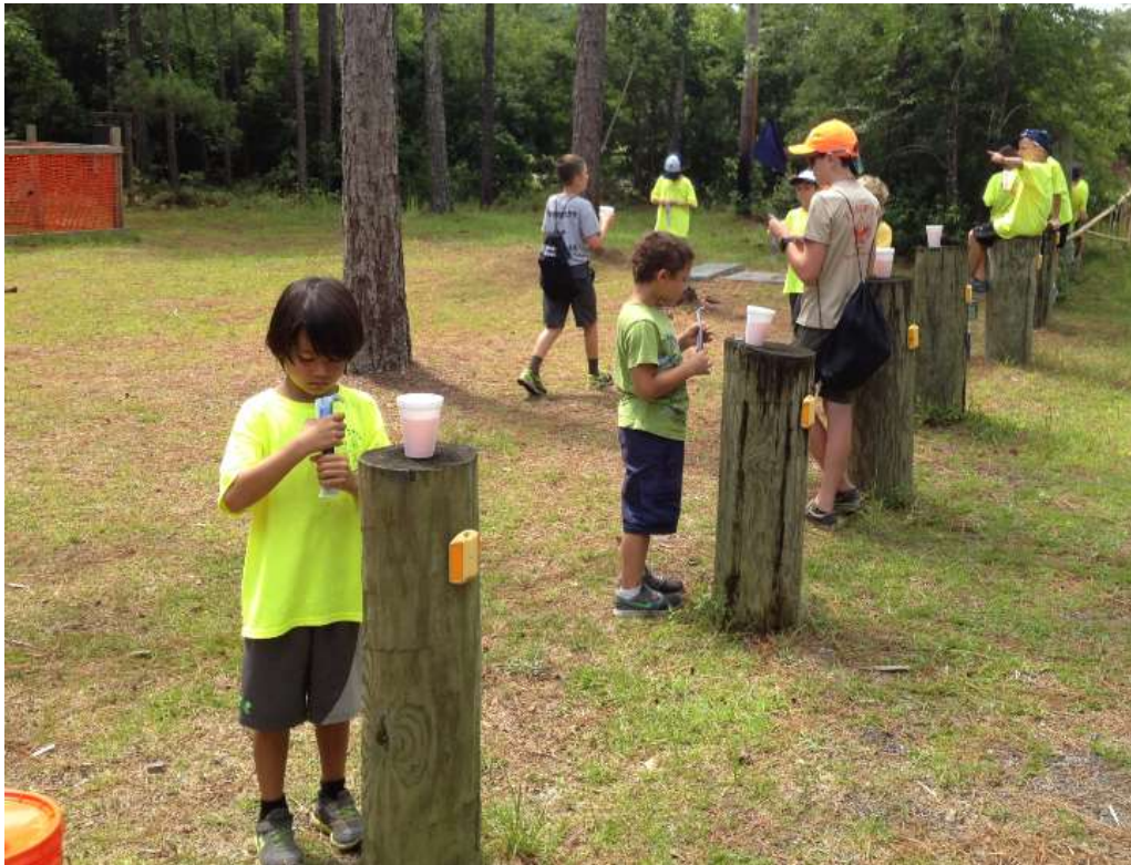
Each morning and afternoon Scouts enjoyed ice-cold KoolAid and frozen yogurt tubes.