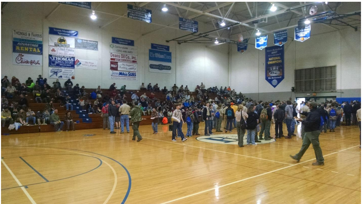
Barton College was a HUGE help. Not only did they provide the facility, but they also fed 500 Scouts and Scouters in 1 hour!