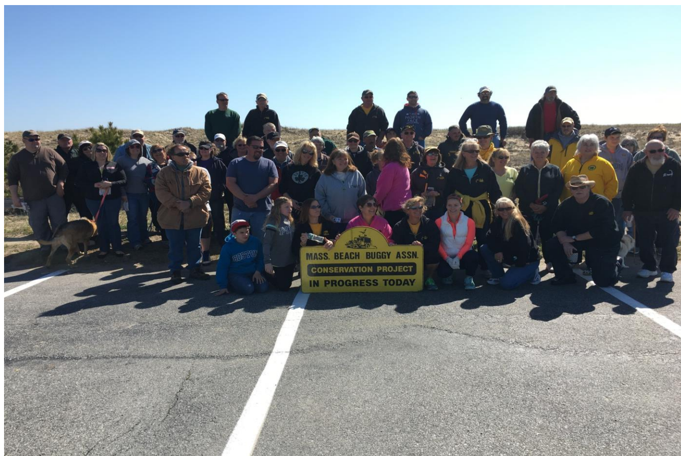
Salisbury Beach project volunteers April 30, 2016

*Please plan to arrive early projects begin at 9:30 AM sharp.