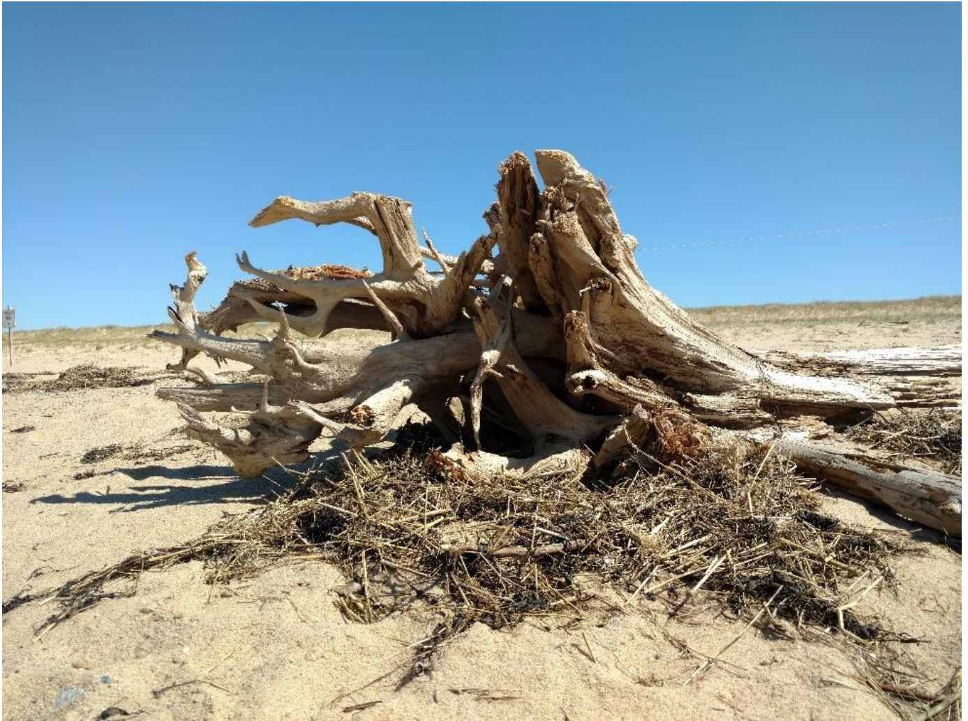
Beach Art