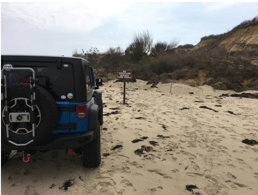
Land slide at Coast Guard Beach