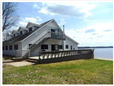
Dining Hall - West Side