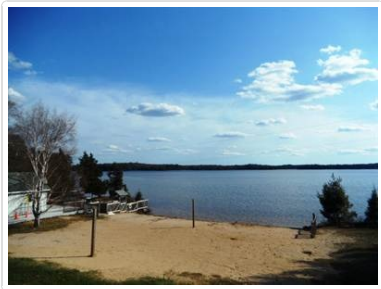
Waterfront Views from Dining Hall Deck