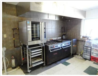
Kitchen - Moffat Stove & Convection