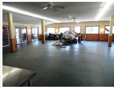
Dining Hall - Interior (1)