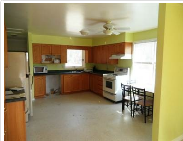
MH - Kitchen Area