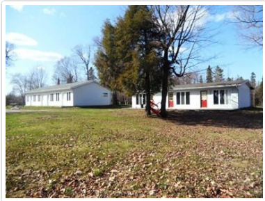
Motel #1 & #2