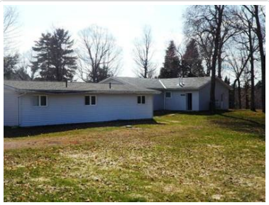
Motel #1 & #2 from Rear