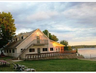
Dining Hall @ Sunset