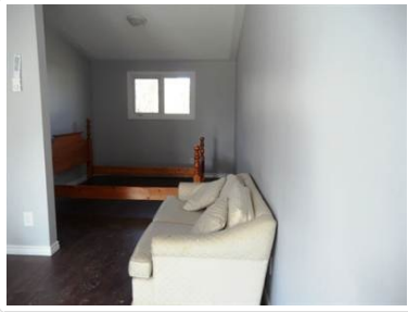
Motel #2 - Typical 1 Bedroom unit