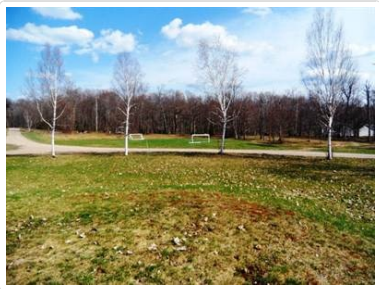
Soccer Field Area