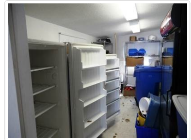
Kitchen - Storage Room