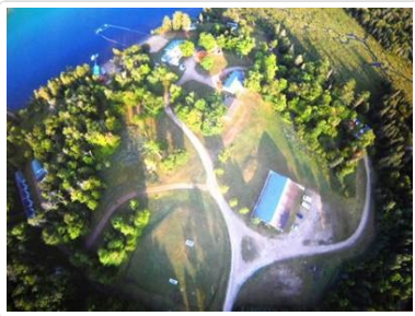
Aerial of Property