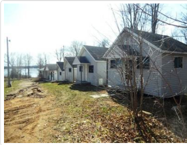
Cabin 8 -10 & Washrooms