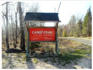
Main Gate Road Sign