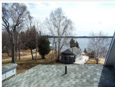
View of Waterfront