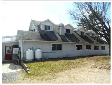
Dining Hall - North Side