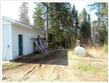
Gas Pump Station