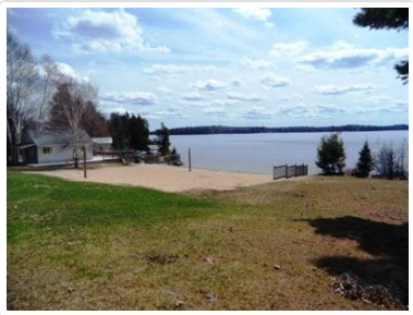
Waterfront with Beach Volleyball