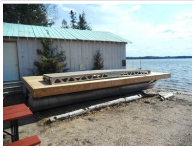
Floating Dock - New