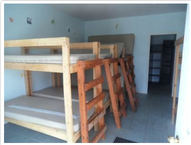
Motel #1 - Typical Room