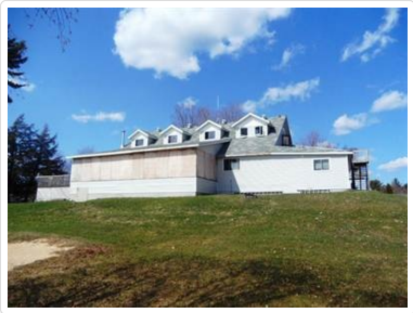
Dining Hall - South Side