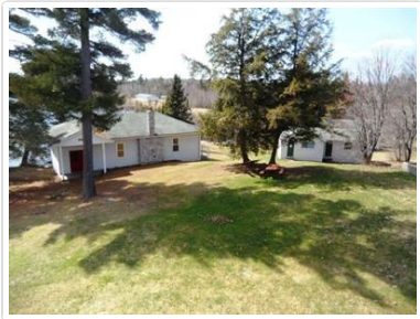
Rec Hall & Staff Cabin