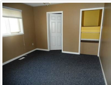
MH - Master Bedroom with 2 PC Ensuite