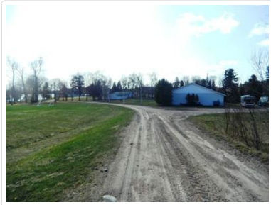
Road in to Main Site