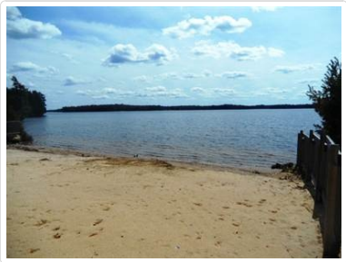
Waterfront - Sandy Beach