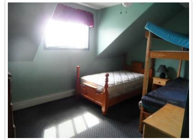
DH - Upstairs Bedroom 3