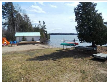
Waterfront Boat House Area