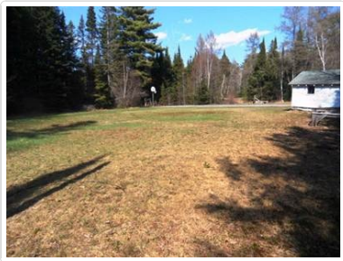
Field Area and Archery