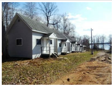
Cabins 1 - 7