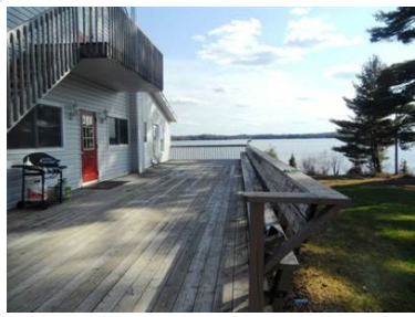
Dining Hall - West Side Deck