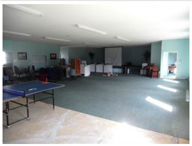
Assembly Hall Interior & Theatre