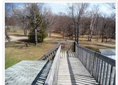
DH - East Stairs