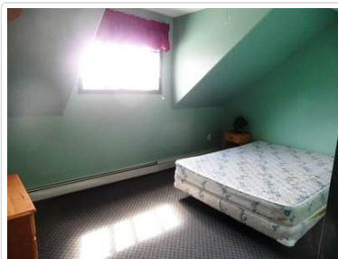
DH - Upstairs Bedroom 1