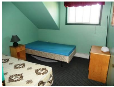
DH - Upstairs Bedroom 5