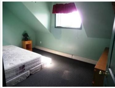
DH - Upstairs Bedroom 4