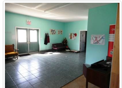
Assembly Hall - Main Entry area