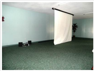
Assembly Hall - Theatre Stage