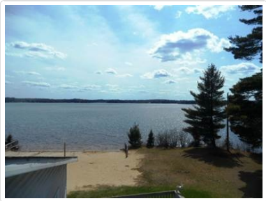
Waterfront View from Upper Deck