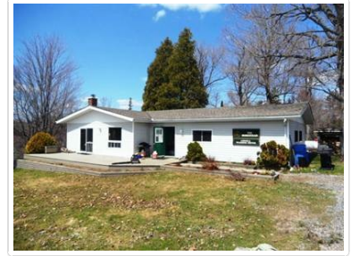
The Homestead Retreat Centre