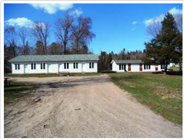
Motel #1 & #2 - Front View