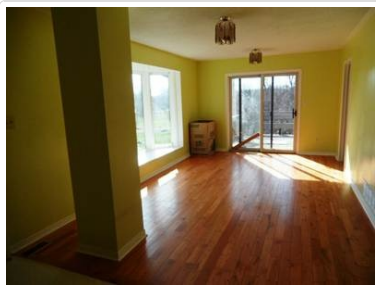
MH - Living Room