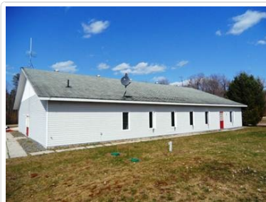
Assembly Hall & Theatre