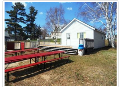
Tuck Shop Deck Area @ Waterfront