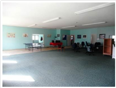
Assembly Hall Interior