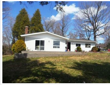
The Homestead Retreat Centre