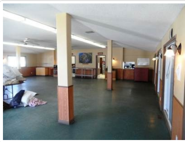
Dining Hall - Interior (3)