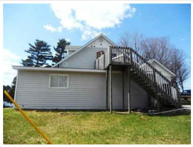
Dining Hall - East Side