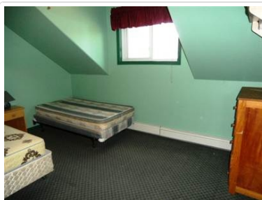
DH - Upstairs Bedroom 2