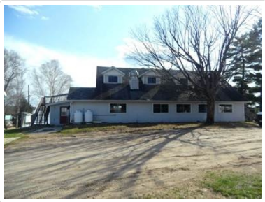
Dining Hall - North Side (2)