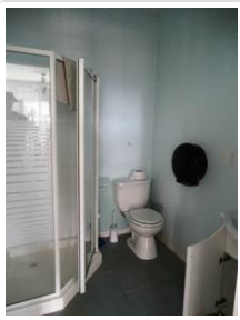
Motel Unit #1 - Unit 3PC Bathroom