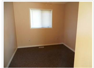
MH - Bedroom 2