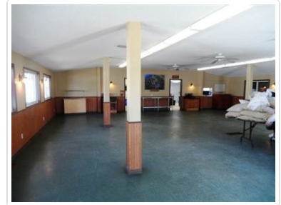
Dining Hall - Interior (2)