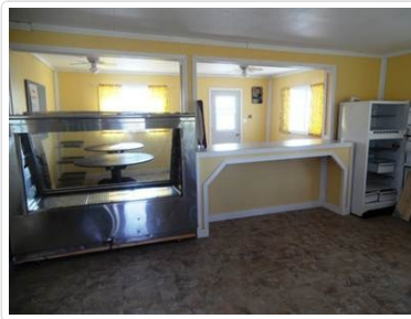
Tuck Shop Interior