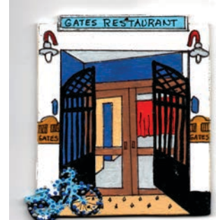
Gates Restaurant 1979-2015