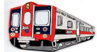
New Canaan M-8 Train c. 2014