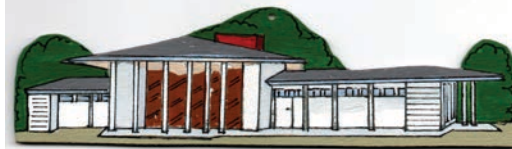
Gores Pavillion, 1960