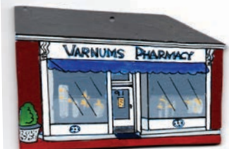
Varnum's Pharmacy c. 1960