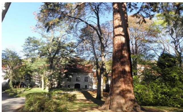
Sequoiadendron in Banska Stiavnica Botanical Garden

The National Park of Slovensky Kras is the largest karstic area in middle Europe. Visit and walk down the nature trail in Zadiel gorge. Besides the wonderful formation of the karst landscape this area has a high diversity of flora and fauna.