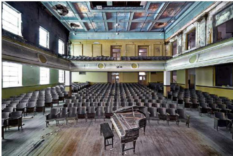
Fabiano Parisi The Empires of Light Series, No. 03 - USA, 2014 Edition of 8 C-type photograph mounted on dibond in tray frame 29.5 x 43.3 in.