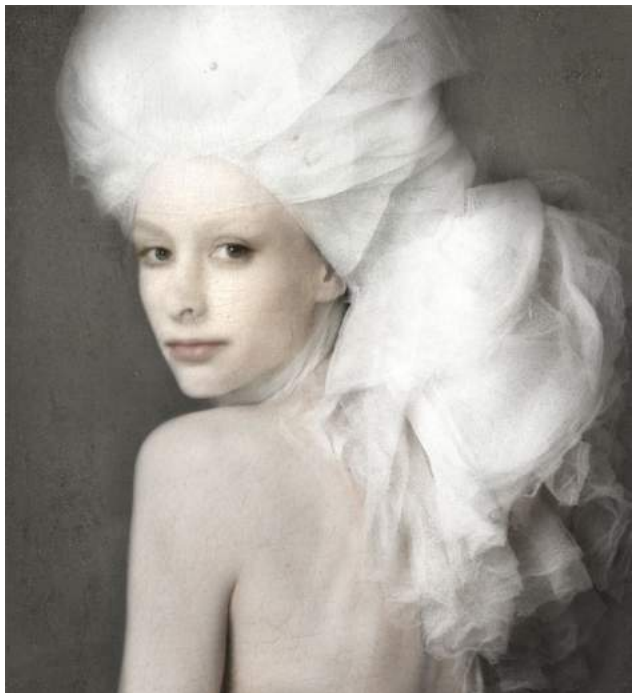
Isabelle Van Zeijl You & I , 2016 Edition of 7 Perspex face mounted C-print on dibond in tray frame 43.3 x 39.4 in