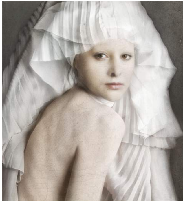
Isabelle Van Zeijl Youth , 2016 Edition of 7 Perspex face mounted C-print on dibond in tray frame 43.3 x 39.4 in