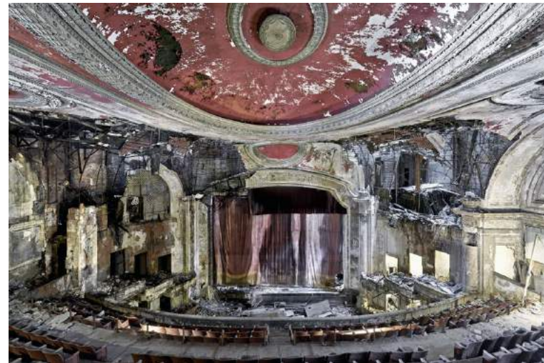
Fabiano Parisi The Empires of Light Series, No.02 - USA, 2014 Edition of 8 C-type photograph mounted on dibond in tray frame 29.5 x 43.3 in.