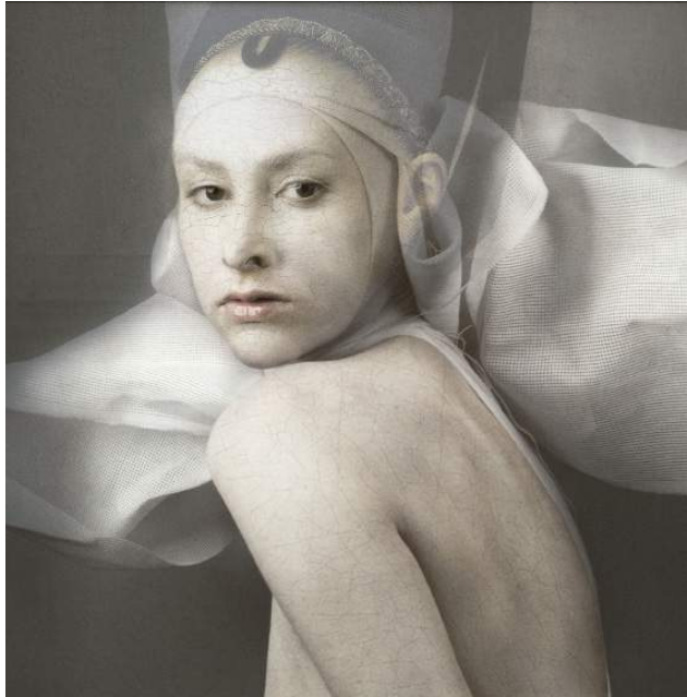
Isabelle Van Zeijl She , 2014 Edition of 7 Perspex face mounted C-print on dibond in tray frame 43.3 x 39.4 in