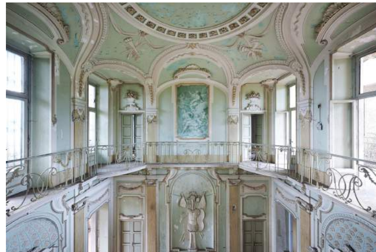
Fabiano Parisi Il Mondo Che non Vedo 201 - Italy, 2016 Edition of 8 C-type photograph mounted on dibond in tray frame 39.4 x 59 in