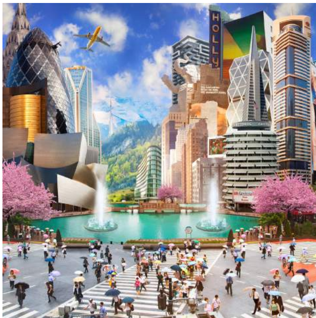
Tom Leighton The Capitol , 2016 Edition of 5 C-type digital print, perspex mounted 60 x 60 in