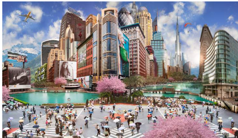
Tom Leighton The Lakes , 2015 Edition of 5 C-type digital print, perspex mounted 63 x 108.8 in