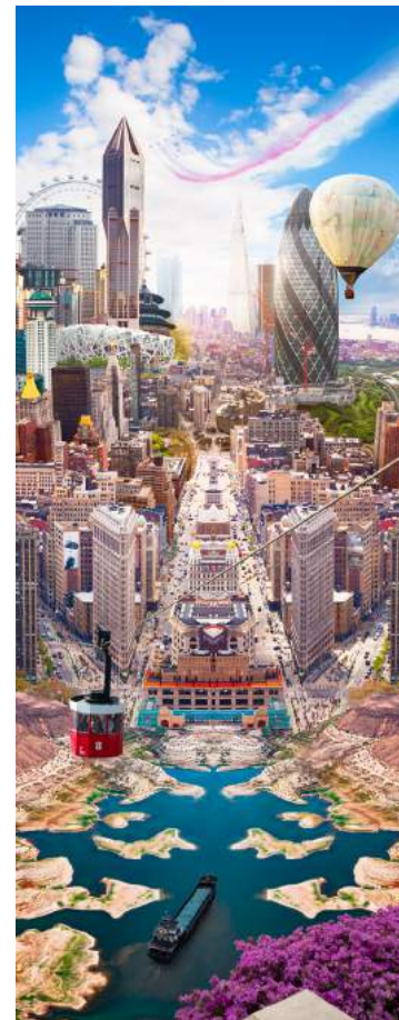
Tom Leighton Flatiron , 2016 Edition of 5 C-type digital print, perspex mounted 72 x 28 in