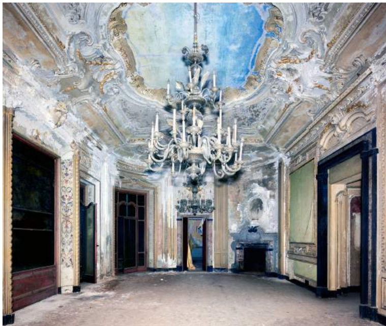
Fabiano Parisi Il Mondo Che non Vedo 202 - Italy, 2016 Edition of 8 C-type photograph mounted on dibond in tray frame 43.3 x 53.1 in