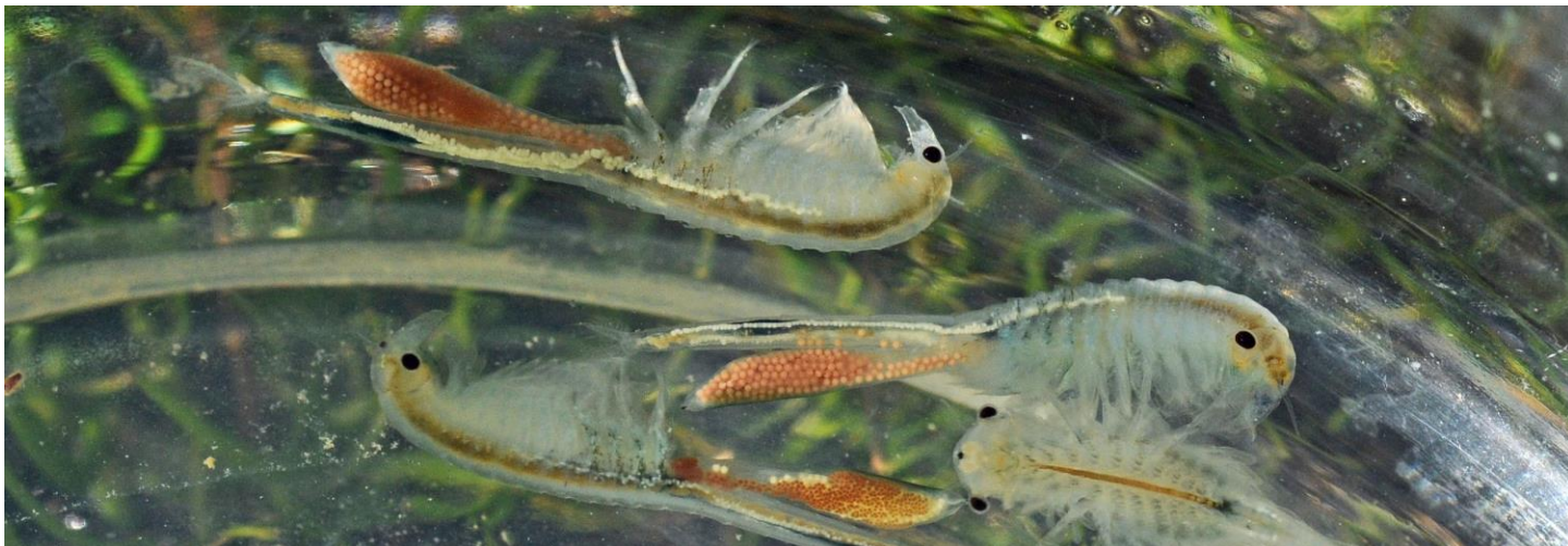
Conservancy fairy shrimp at Jepson Prairie