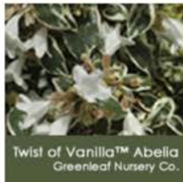
Twist of Vanilla™ Abelia Greenleaf Nursery Co.