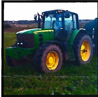
13 Deere 7330 MFWD – 1098hrs