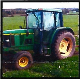
99 Deere 6310 2wd – 2855hrs