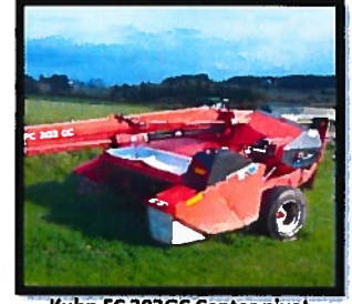
Kuhn FC 303GC Center pivot disc mower