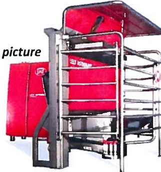
2013 LELY ASTRONAUT A4 MILKING ROBOT INSTALLED SPRING 2013 BALANCE OF FACTORY WARRANTY REMAINS