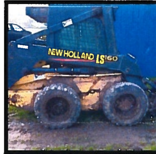
New Holland LS160 – 5110hrs