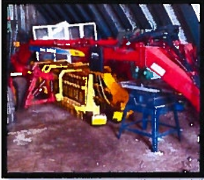
2015 New Holland 216 Rolabar 27ft Hay Rake