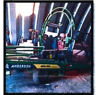
2014 Anderson NWX-660 tubeline bale wrapper