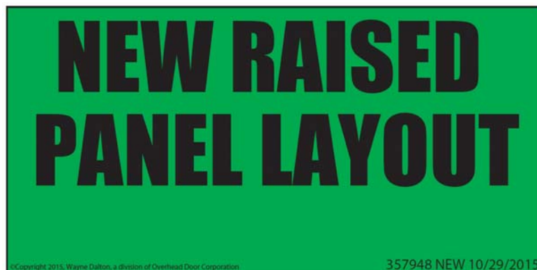
Figure 1: Label on Packaging for Identifying New Embossment Spacing

Replacement sections for the old spacing will continue to be available for up to 2 years. As with previous discontinuations, Wayne Dalton reserves the right to replace a product with equal or greater value, particularly in later time from the changeover as replacement parts no longer make practical and/or financial sense to manufacture or purchase. For example, rather than shipping just one section with the old embossment spacing, we would just replace all the sections on the door at no additional cost.