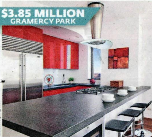
Halstead Property, LLC.

No offense to your powers of imagination, but this duplex penthouse perched 41 (and 42) floors above East 25th Street, off Madison Avenue, "has to be seen to be believed." The suspension of disbelief begins with an "expansive" living area with "breathtaking" views and continues through the designer kitchen, and on up to the master bedroom suite and two private roof terraces with unobstructed "panoramic" views of the city and river. The 1,859 square feet of interior includes two bedrooms, two bathrooms, and opens on to four outdoor spaces altogether (can you believe it?). Agent: Dale Irwin, Halstead Property, 212-381-2228