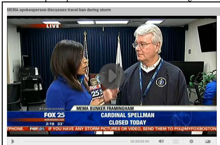
MEMA Spokesperson discusses travel ban during storm

Which agency(s) is not telling the truth - NRC, FEMA, or MEMA?