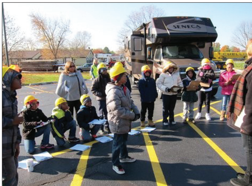
Students at Woodgate Elementary School in Village of Matteson, Ill., learn about an engineering public works and contracting project to add 19 ft to the stem of an elevated water tank near their school.

The sphere was cut from the existing stem, lifted off, and moved laterally away from the existing stem and pedestal (see the right-hand photograph on page 28). The sphere hung suspended by two 550-ton Mega Wing cranes for approximately five hours until the old stem was removed and the new stem was installed. A 240-ton Mega Wing crane was then used to remove the