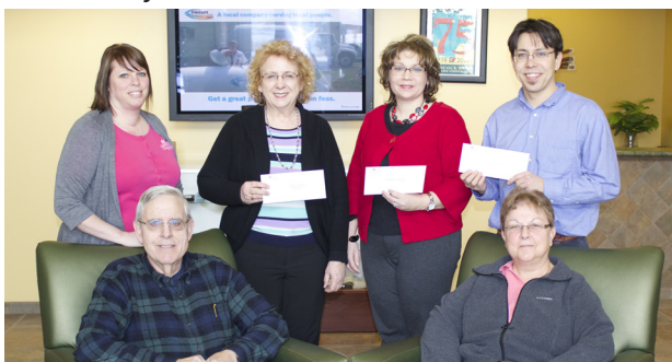
The Community Trust Fund's February 2015 donation presentation.

The next round of grant applications are due Monday, April 7. More information on applying for a grant can be found online at hwe.coop/community-involvement .