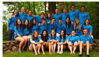
2014 Summer Staff

Our summer staff in shaping up to be another incredible group of young adults eager to share their love and grow in their faith this summer!