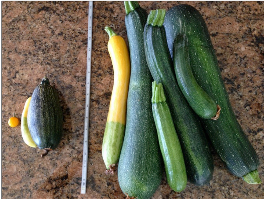
Squash from BCC garden on left/squash from my garden on right

Our garden is both a teaching garden for our children during the school year and a potential community garden for our members. If you'd like to help grow our garden, please consider a donation towards purchasing soil rich in worm castings, additional compost materials, bat guano, and kelp meal.