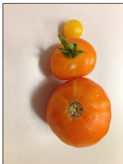
Tomatoes from our garden for the last month