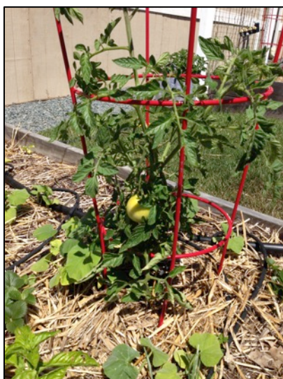
BCC garden tomato plant - 7/23/15

Soil, soil, toil, and trouble. . . what a difference healthy soil can make. Our little garden is struggling to grow. This summer, we've been watching the plants as they grow a little bit and produce a few fruits and vegetables. Although, it's heartening to see, the plants are nowhere as large or as productive as they should be. The following are a few examples of the difference. The plants in our garden and in my home garden are from the same source, and planted at the same time. The watering and monitoring are identical. The only difference is the soil quality: