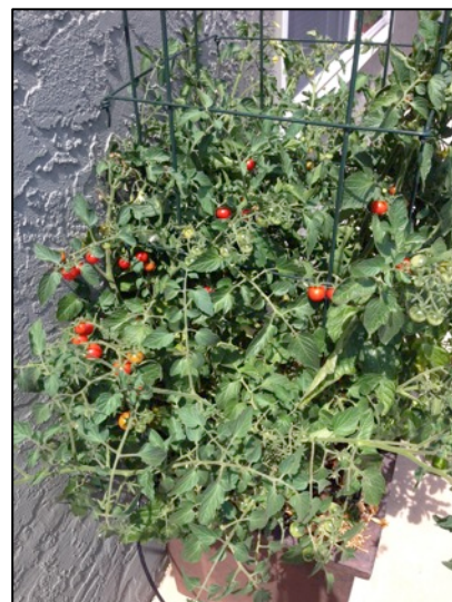
My container tomato - 7/23/15