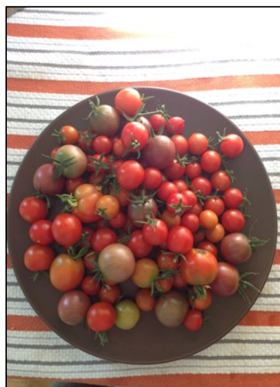
Tomatoes picked from my garden on Thursday - weekly supply